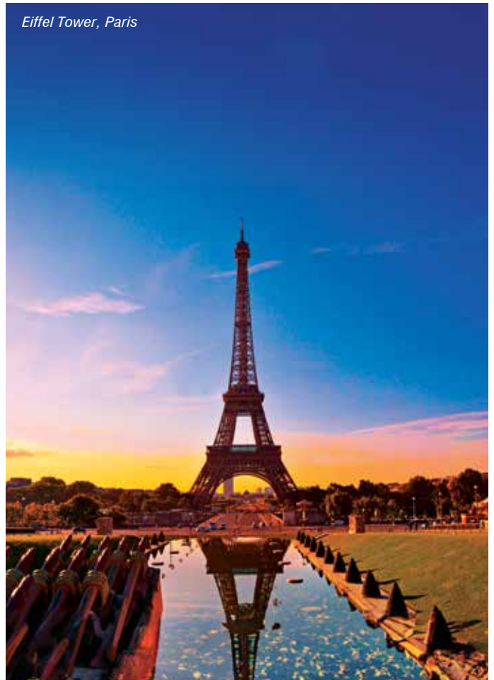
Eiffel Tower, Paris