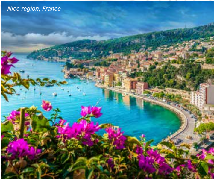
Nice region, France