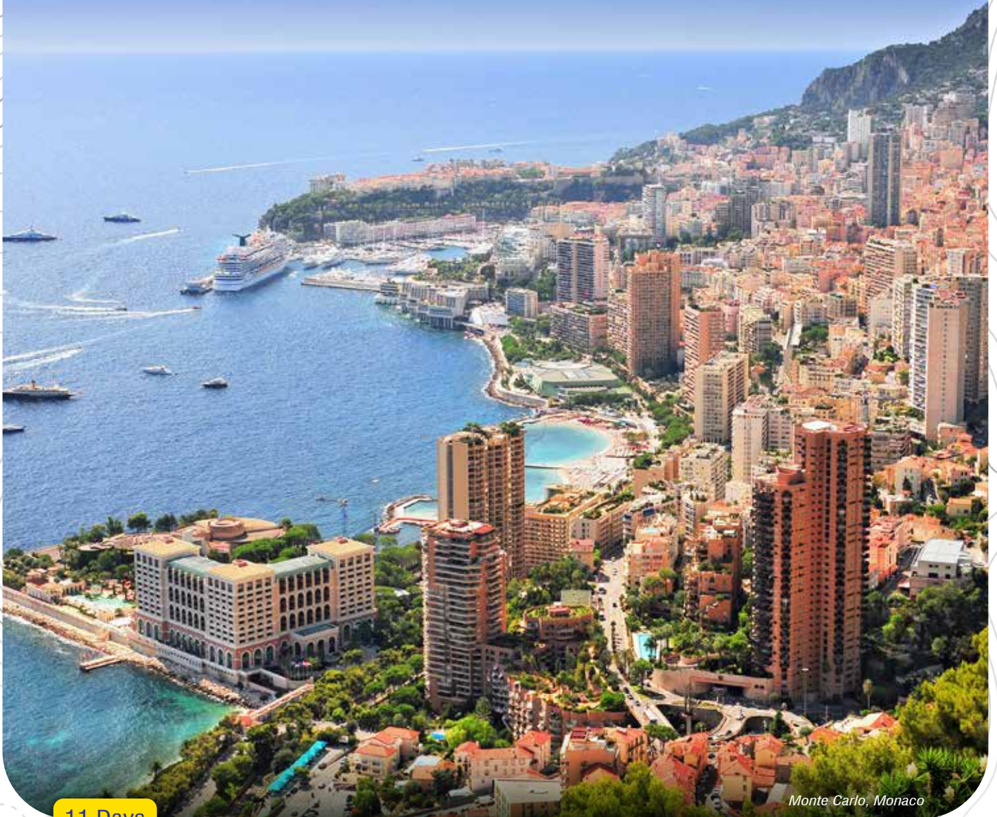
Monte Carlo, Monaco