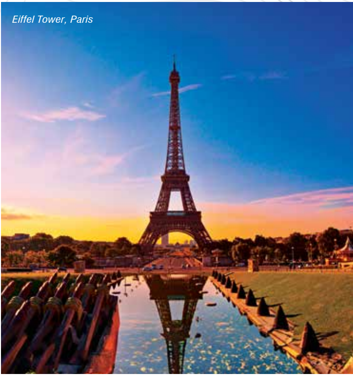
Eiffel Tower, Paris