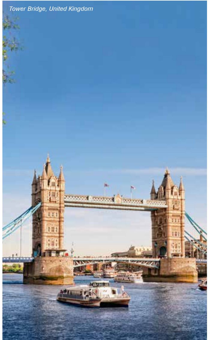
Tower Bridge, United Kingdom

Switzerland: • Orientation tour of Geneva • Visit Glacier 3000 • Orientation Tour of Saanen & Gstaad • Ride on the Scenic Golden Pass Train • Orientation tour of Lucerne • Cruise on Lake Lucerne • Visit Lindt: Home of Chocolate • Excursion to Jungfrauoch with lunch and Interlaken