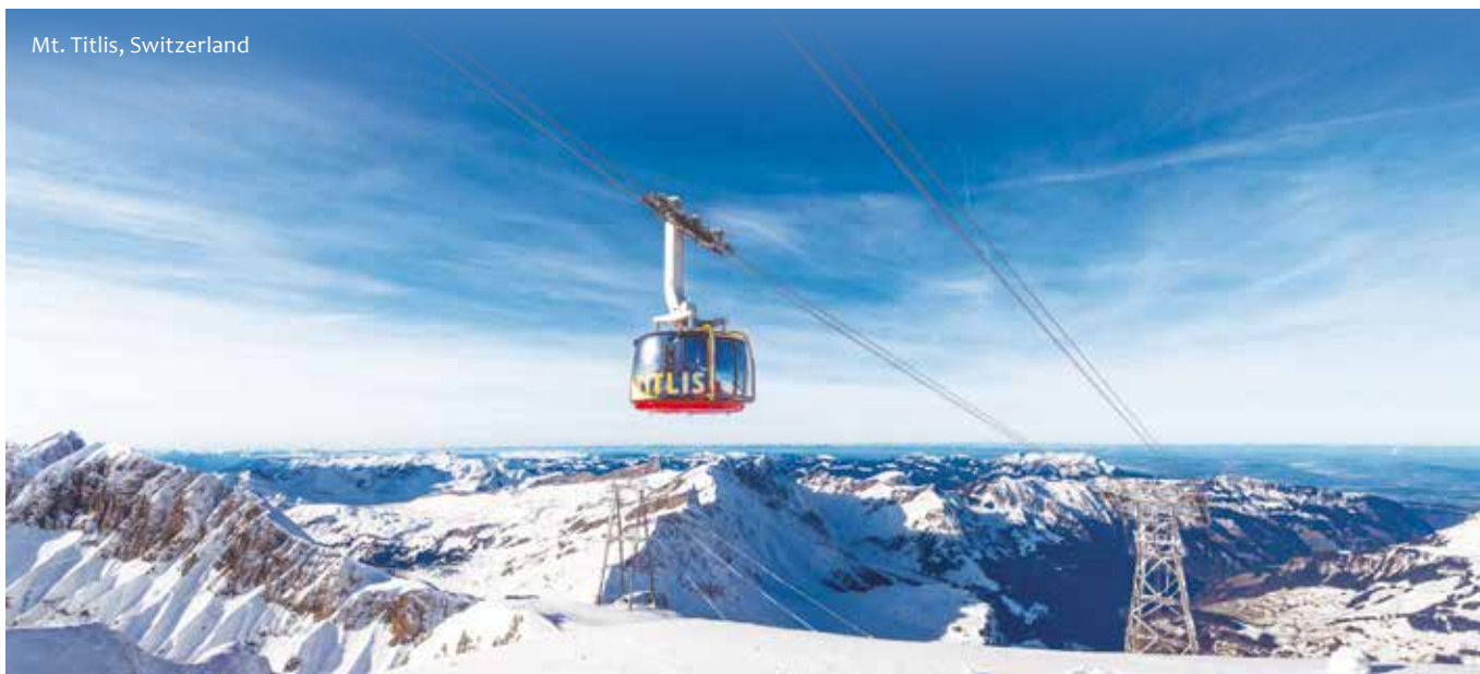
Mt. Titlis, Switzerland

Jungfrauoch - The Top of Europe. We take the cable car followed by a cogwheel train up to a height of 3,454 meters to Europe's highest railway station. Visit the Ice Palace and the Sphinx observatory deck to view the longest glacier in the Alps. Later, we visit Interlaken.