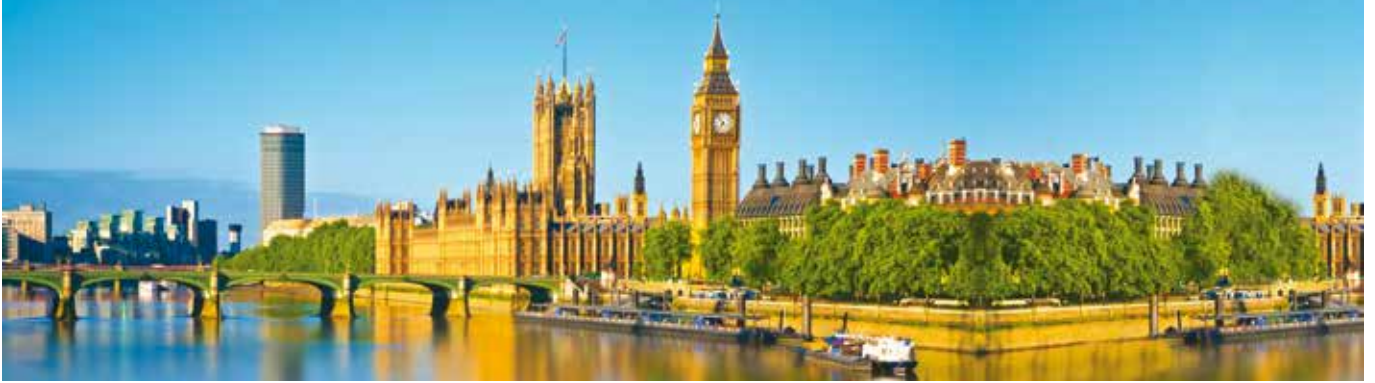
Big Ben, London