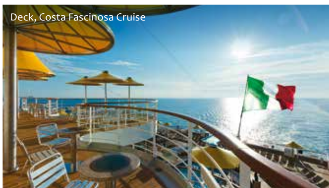
Deck, Costa Fascinosa Cruise

Note: • In major European cities, there are parking restrictions for coaches, and it is not possible to stop at all the places during the city tour. Your Tour Manager will try his/her best to stop coach wherever possible for a photo stop. • The above-mentioned cruise itinerary is a tentative itinerary and is subject to change without prior notice. For the exact sailing itinerary, please contact your sales staff. • Arrival / Departure Transfers will be provided subject to minimum 4 passengers travelling together.