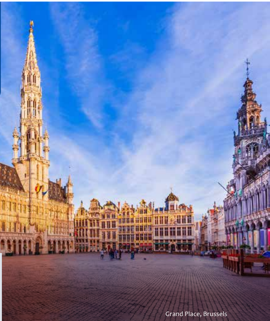
Grand Place, Brussels

MEDITERRANEAN CRUISE: • Visit Marseille, France • Visit Barcelona, Spain • All included On-board amenities such as International Shows, Live Music and more.