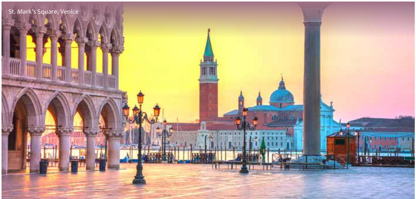
St. Mark's Square, Venice