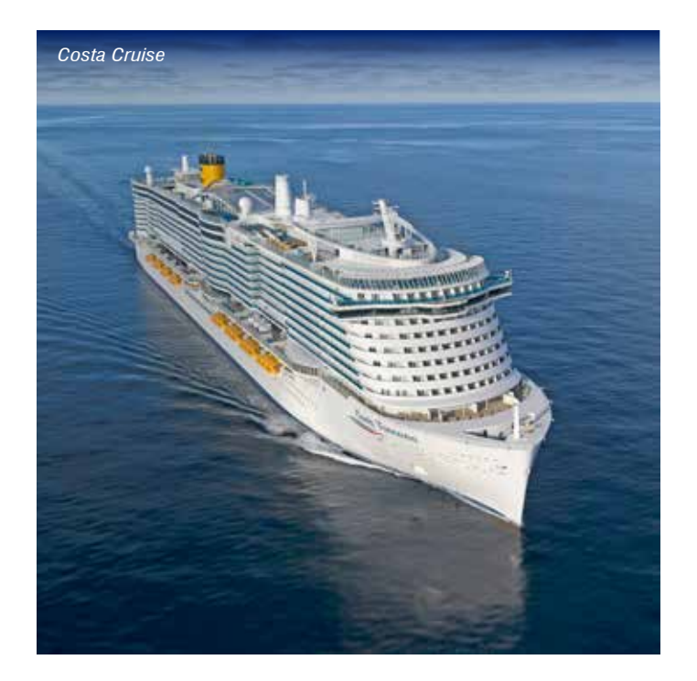
Day 19: Valencia