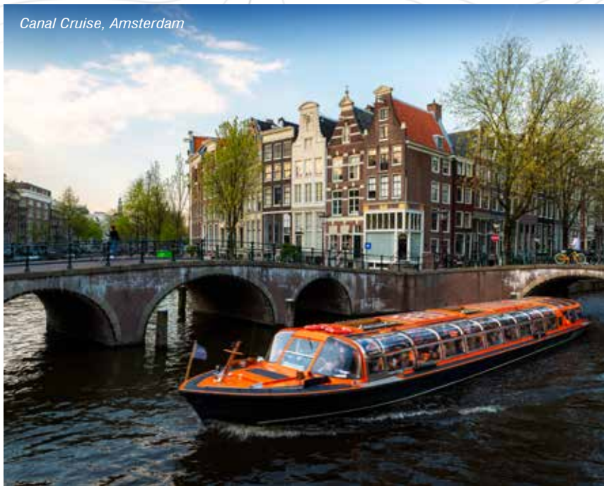
Canal Cruise, Amsterdam