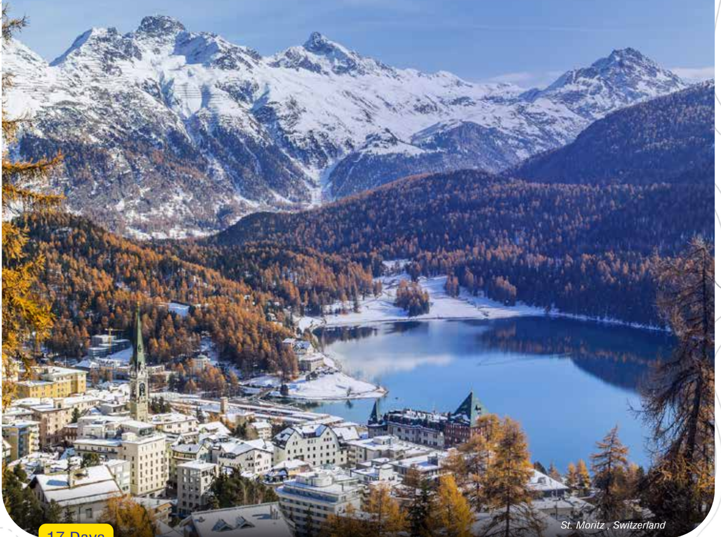
St. Moritz , Switzerland