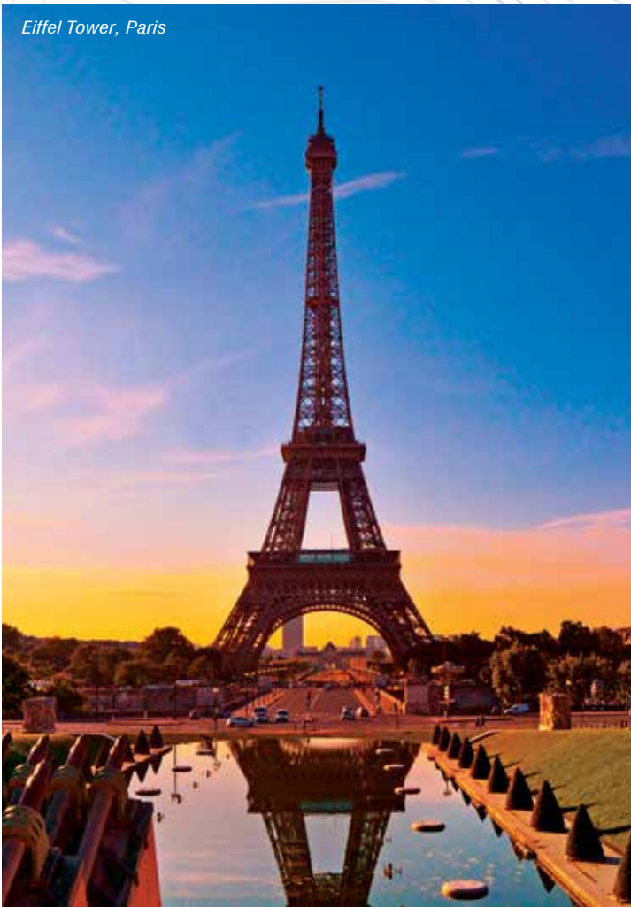
Eiffel Tower, Paris