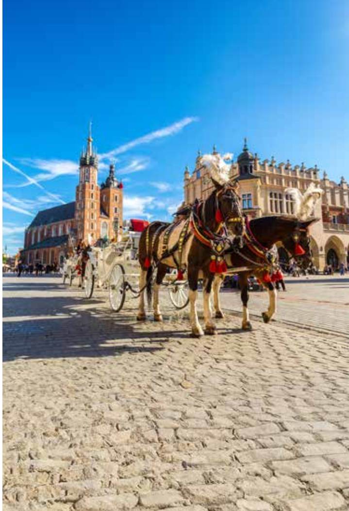
Horse Carriage ride, Poland