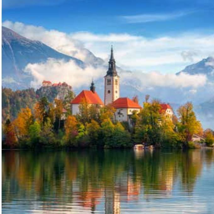
Bled Castle, Slovenia