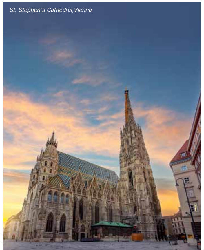
St. Stephen’s Cathedral, Vienna

Note: • Due to flight connectivity, a few groups may depart out of Prague instead of Vienna. Kindly check with your sales staff for your exact flight details. • In major European cities, there are parking restrictions for coaches and it is not possible to stop at all the places during the city tour. Your Tour Manager will try his/her best to stop coach wherever possible for a photo stop.