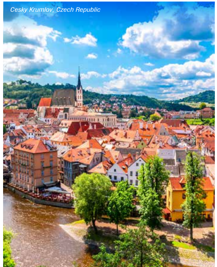
Cesky Krumlov, Czech Republic

Overnight in Prague, Czech Republic. (B, D)