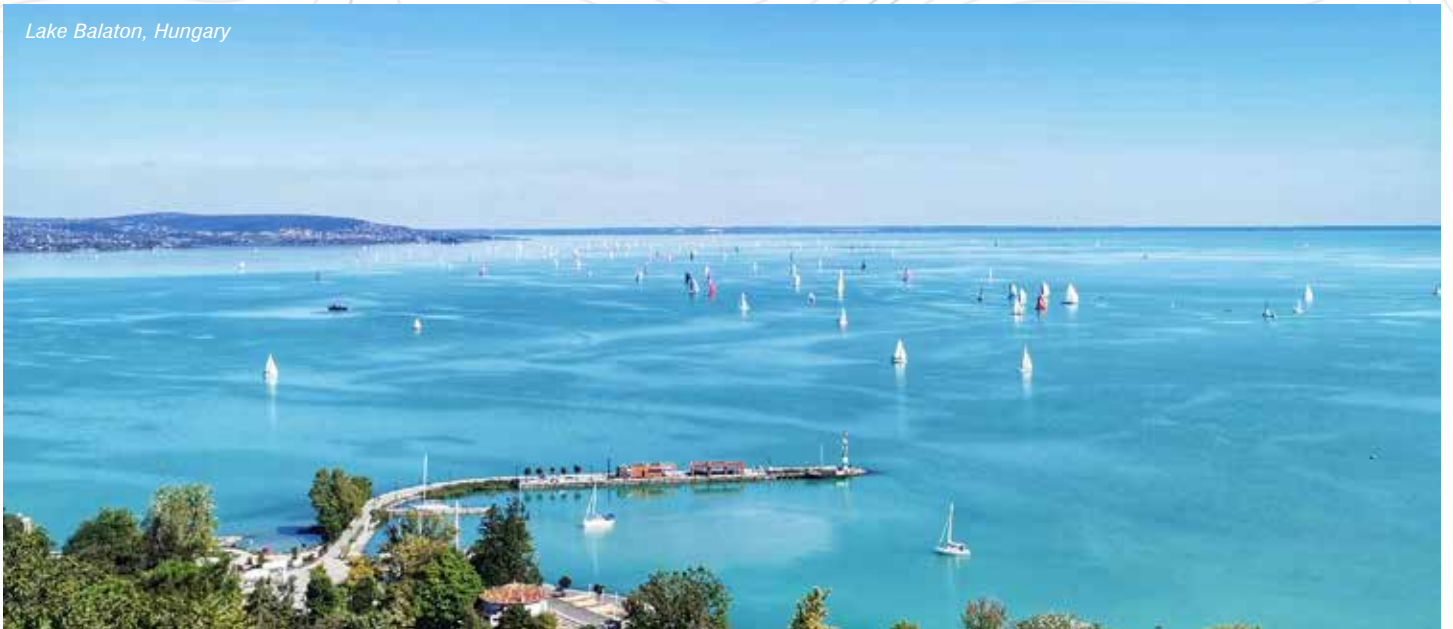
Lake Balaton, Hungary